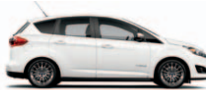
White Platinum Metallic Tri-coat