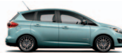
Ice Storm Metallic