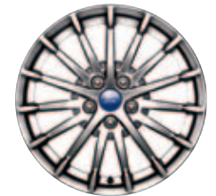
17" Machined Aluminum Standard