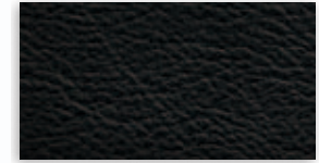
4 Charcoal Black Leather