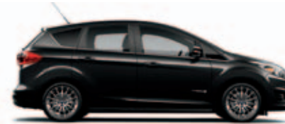
Tuxedo Black Metallic