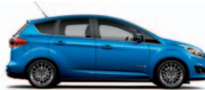
Blue Candy Metallic Tinted Clearcoat