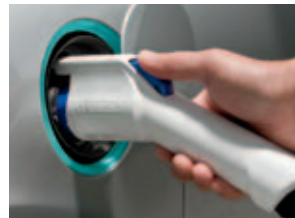
External charge port with LED-illuminated state-of-charge indicator.