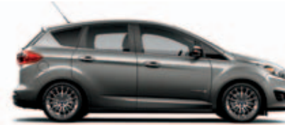
Sterling Gray Metallic