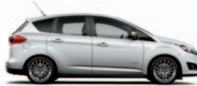
Ingot Silver Metallic