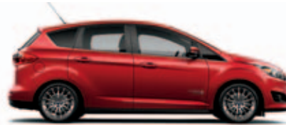
Ruby Red Metallic Tinted Clearcoat