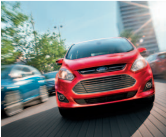
Ruby Red Metallic Tinted Clearcoat. Available equipment.

Interior Protection Package includes front and rear all-weather floor mats and cargo area protector Panoramic fixed-glass roof