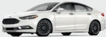
Titanium, Hybrid Titanium and Fusion Energi Titanium