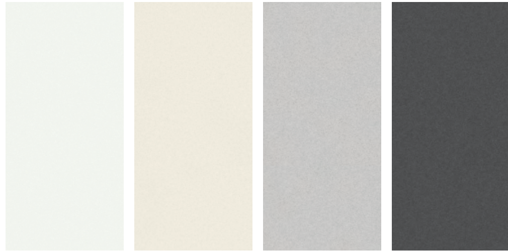
Glacier White QAK Pearl White 1 QAB Brilliant Silver K23 Gun Metallic KAD