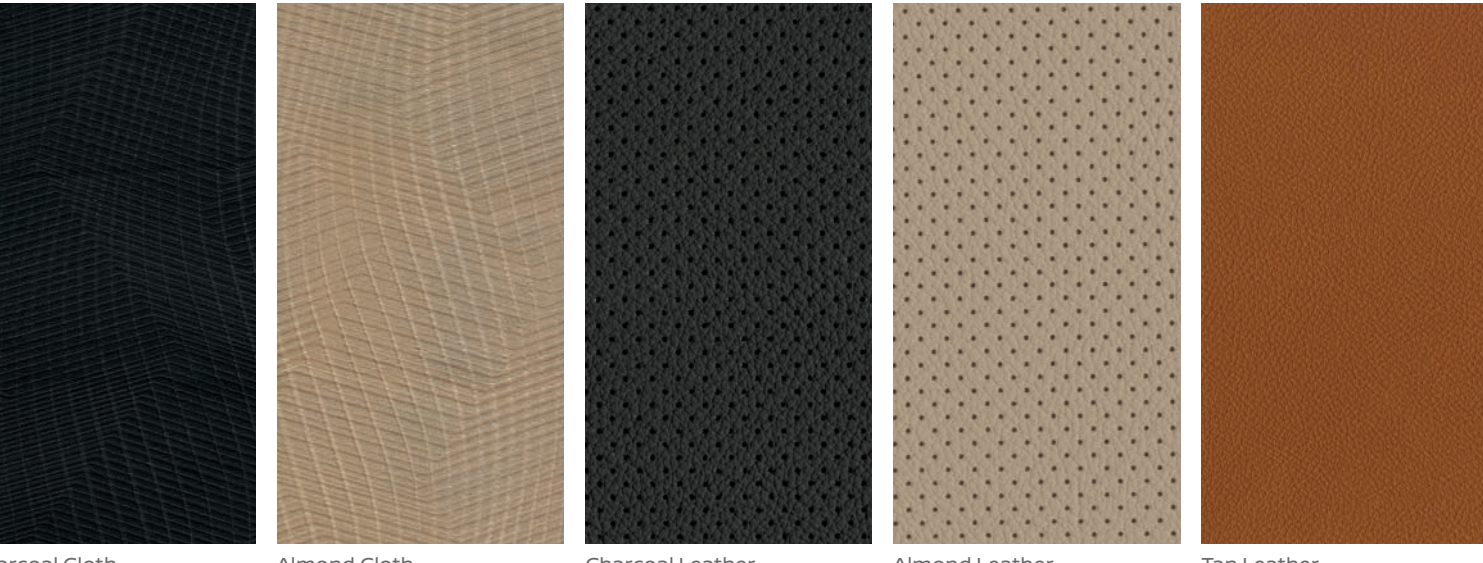
Charcoal Cloth s|sv